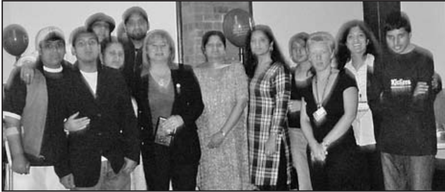
Some members of the Coventry Support Group.

This event was organised by the Coventry Sickle Cell & Thalassaemia Services, together with the Thalassaemia Support Group. It took place at St Peter's Community Centre, Charles Street, in the Hillfields area of Coventry.