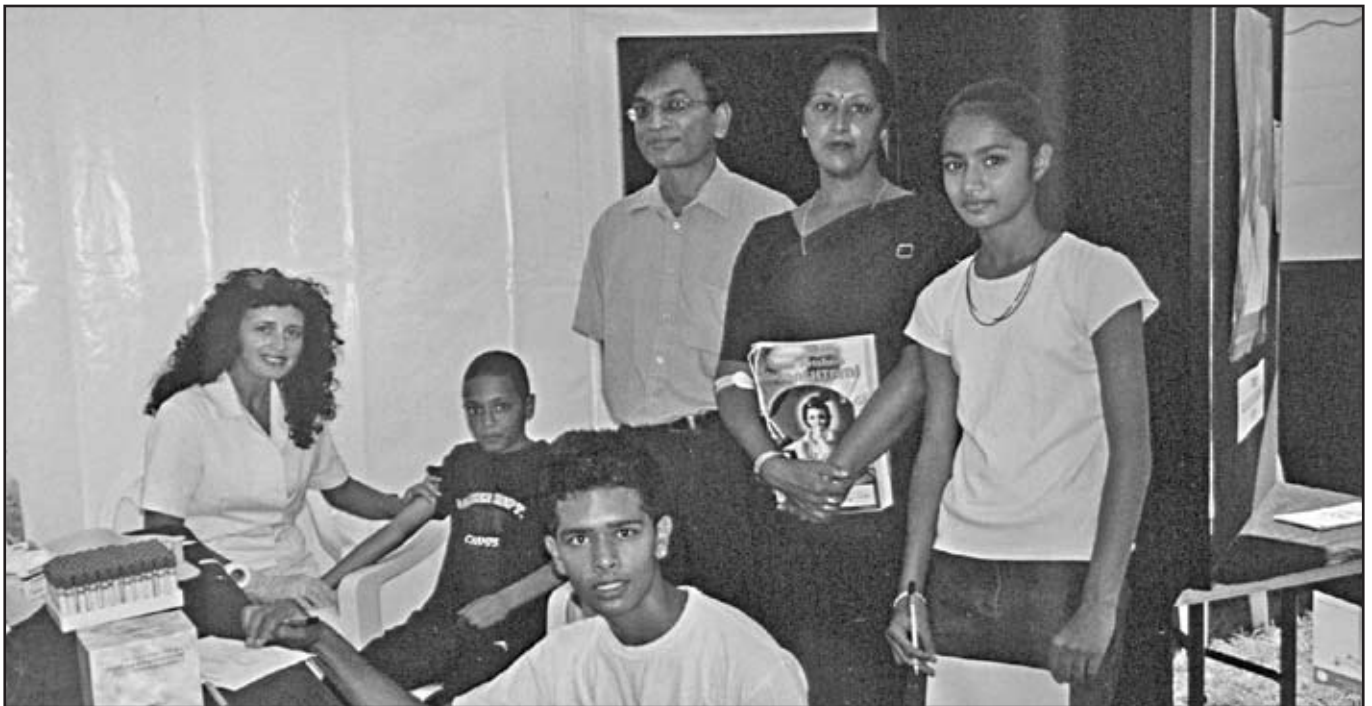
Family members queue up to be screened.

As in previous years, UKTS were invited to take a stall at the Janmastmi Festival, held on 5th and 6th September. This huge event, which marks the most significant date in the Hindu calendar, was held at Bhaktivedanta Manor near Watford. This magnificent estate was donated to ISKCON (the International Society for Krishna Consciousness) by the late George Harrison of Beatles fame. George Harrison became a devotee of Hindu spirituality after travelling to India in 1967 and remained so until his death in 2001.